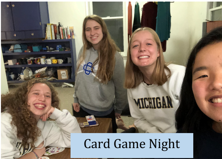
Card Game Night

This has been a great last month of the fall 2019 season. Flywheel is really excited for the winter 2020 season to start! Meanwhile, we had a fun last month training and growing as a team.